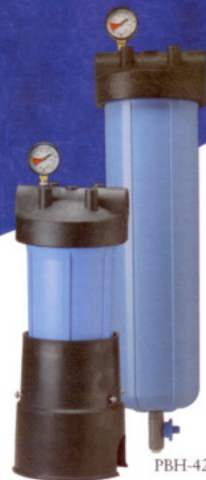
PBH-410 (shown with bag vessel stand)

Bags are available in polypropylene felt, absolute-rated high-efficiency polypropylene and nylon monofilament mesh—ideal for filtering and straining applications from 1 to 800 microns.