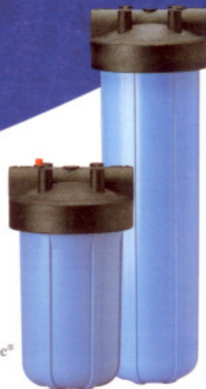
#20 Big Blue®