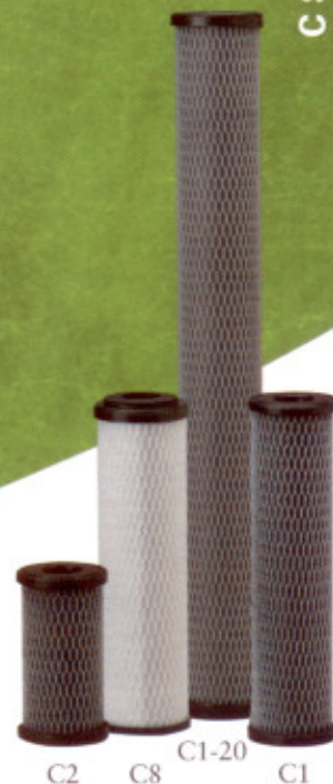
C2 C8 C1-20 C1