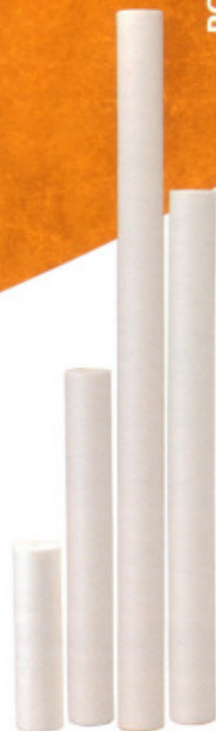
POLYDEPTH® Polypropylene Sediment Cartridges