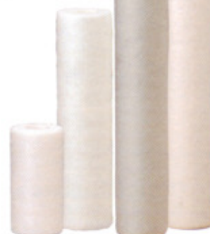
P5-478 P1 P1-20 P1-30 P5 P5-20 P5-30 P25 P25-20